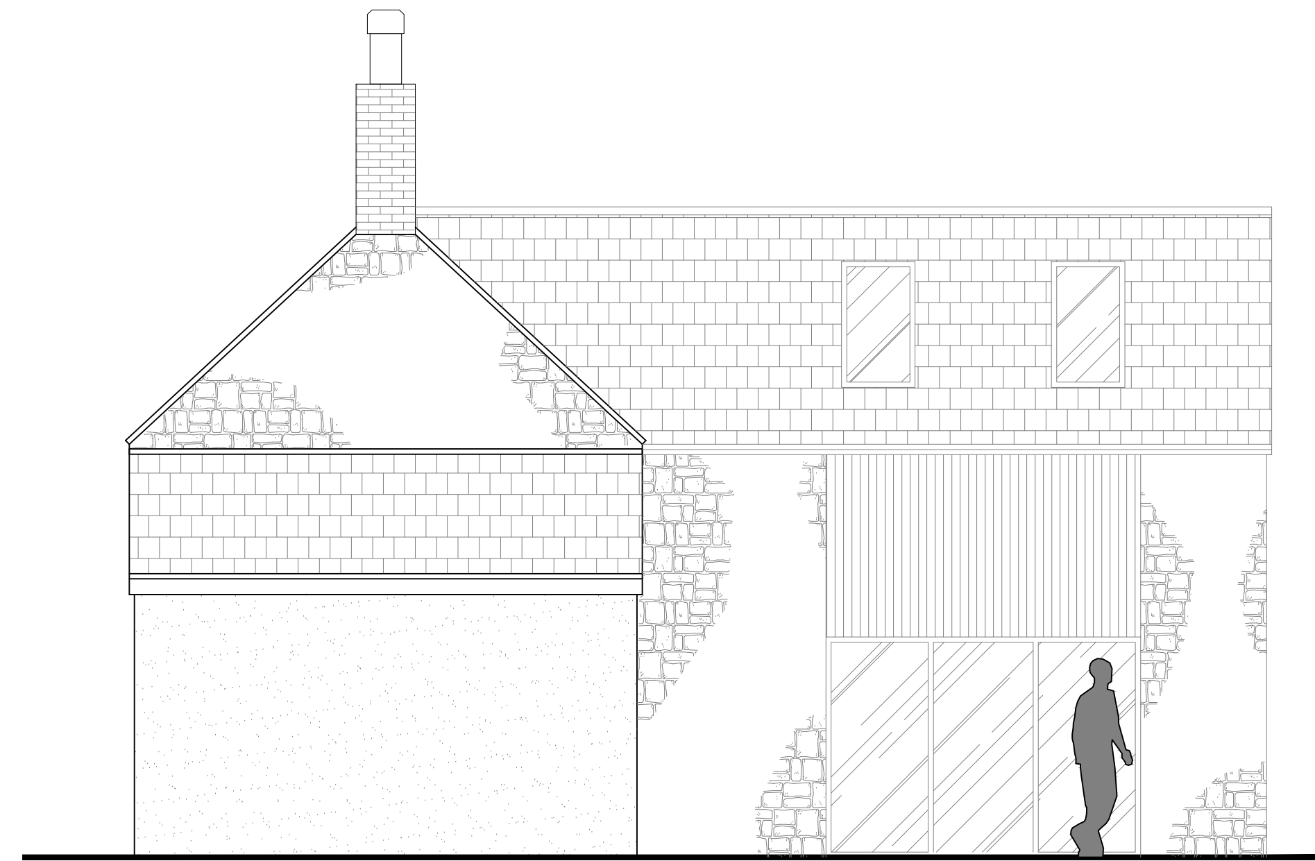
PROPOSED WEST FACING ELEVATION SCALE 1/50