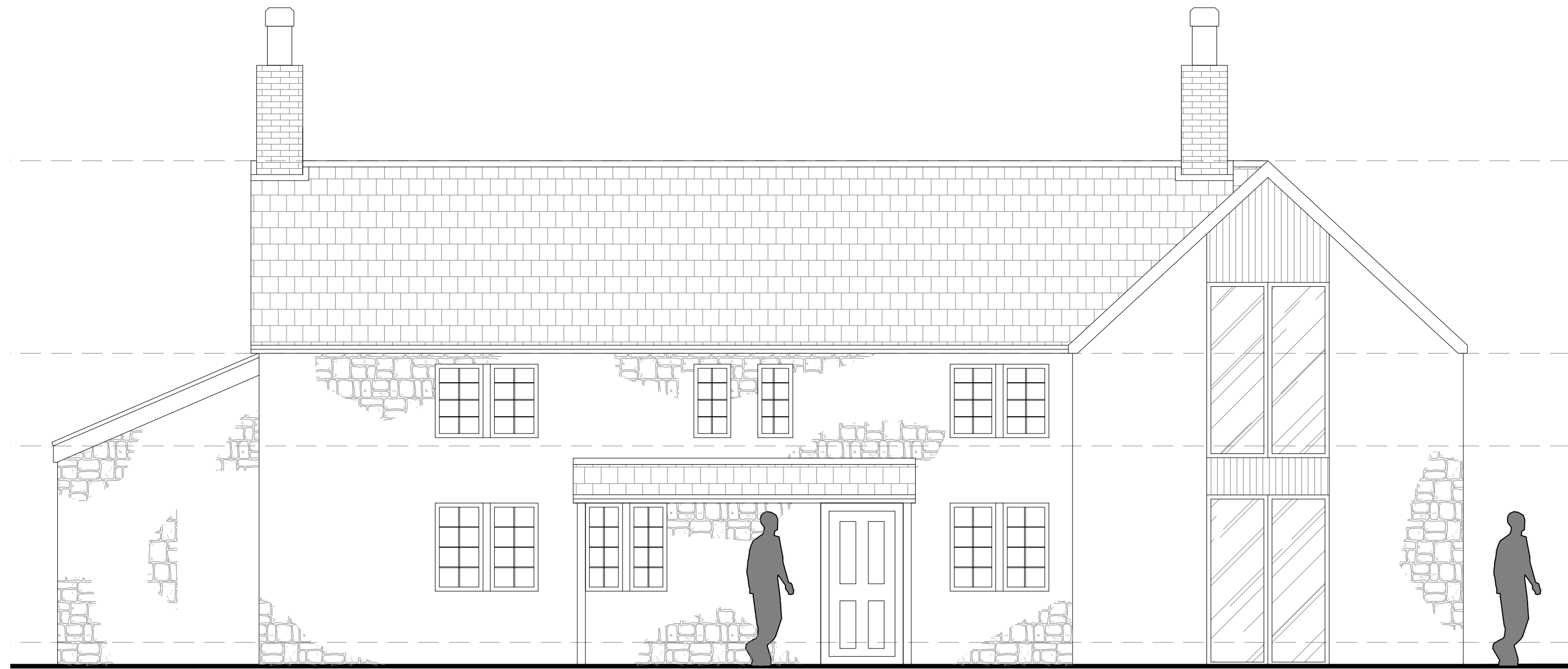
PROPOSED SOUTH FACING ELEVATION SCALE 1/50